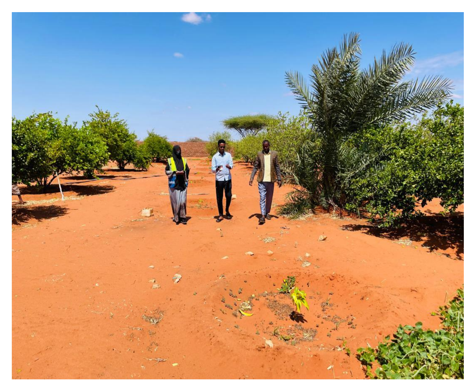
Figure 3: selected land for greenhouse at Bursalax site