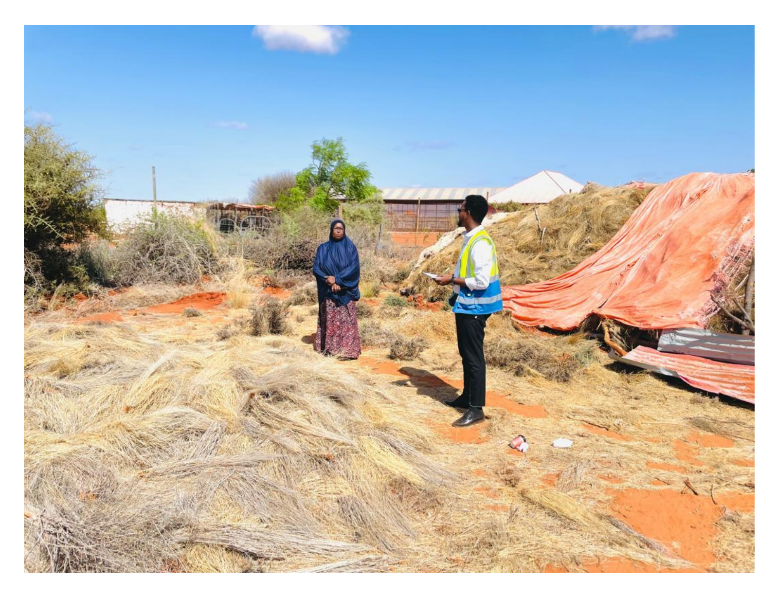
Figure 2: Selected Land for greenhouse installation based on selection criteria at Bursalah site.