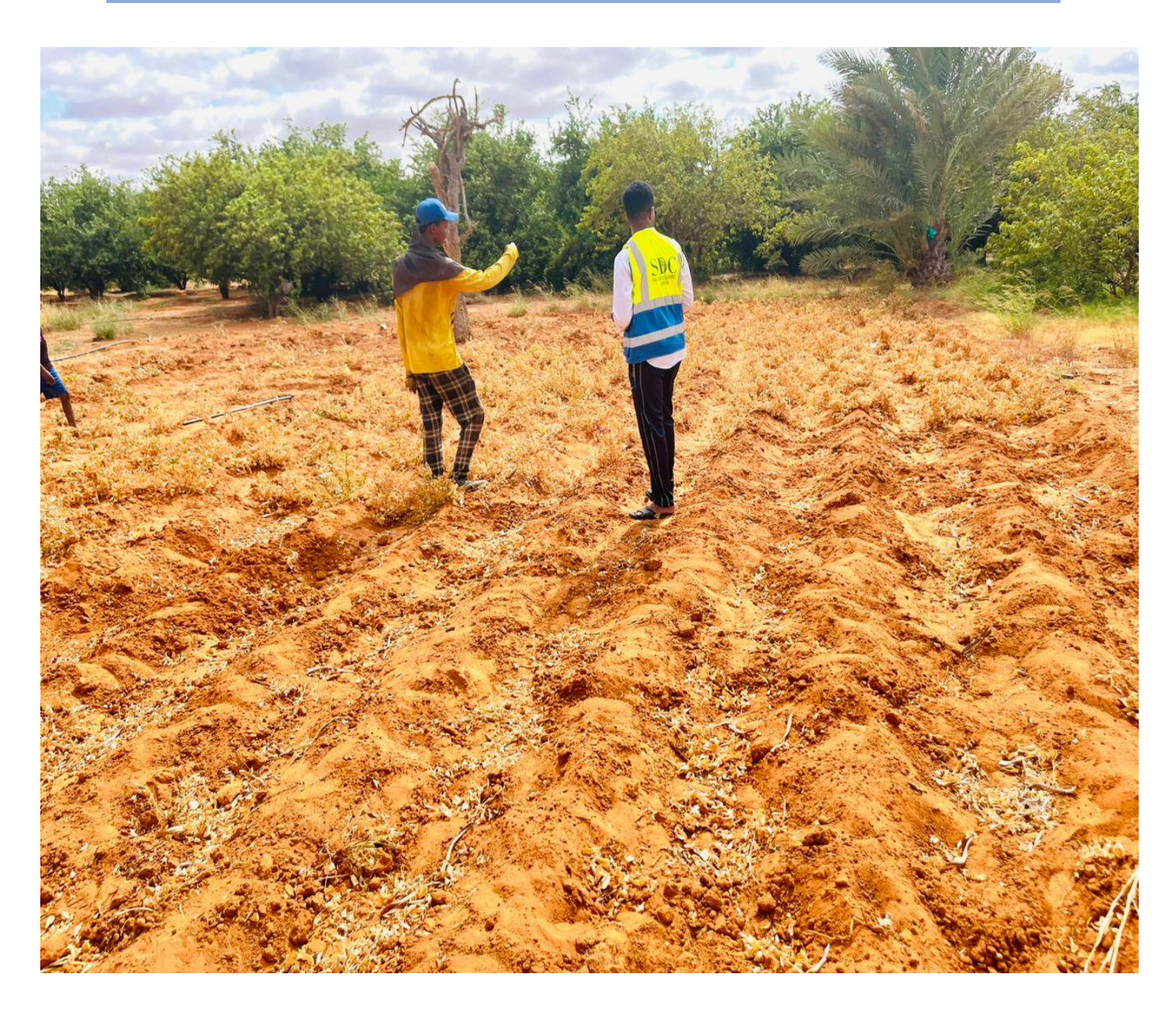
Figure 1: Selected Land for greenhouse installation based on selection criteria at Galdogob.